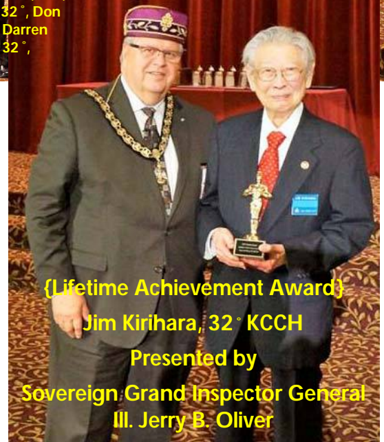
{Lifetime Achievement Award}