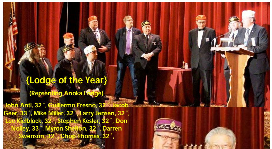
{Lodge of the Year} (Representing Anoka Lodge)