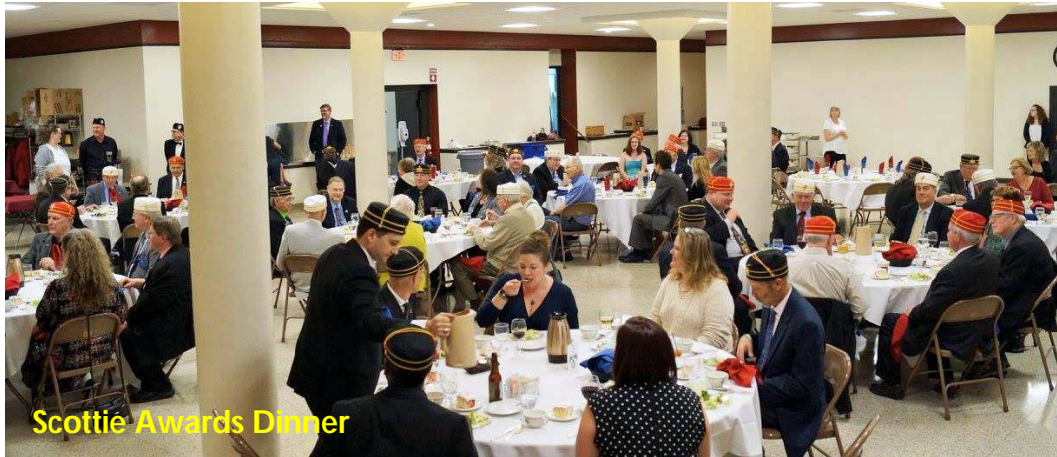
Scottie Awards Dinner