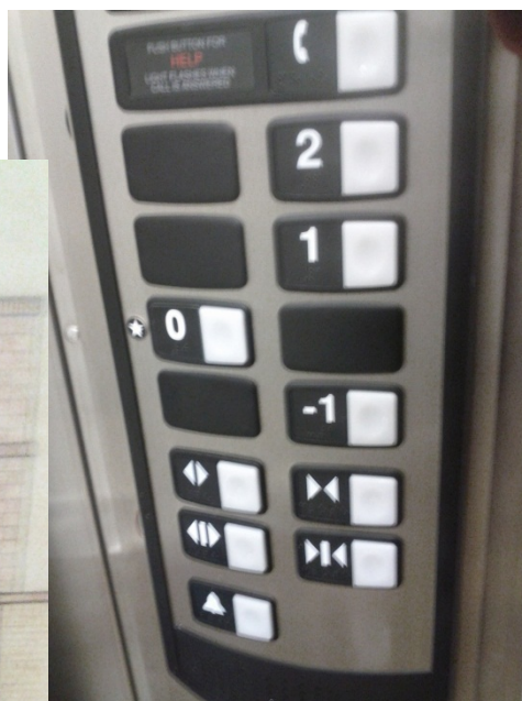
THE CONTROL BUTTONS