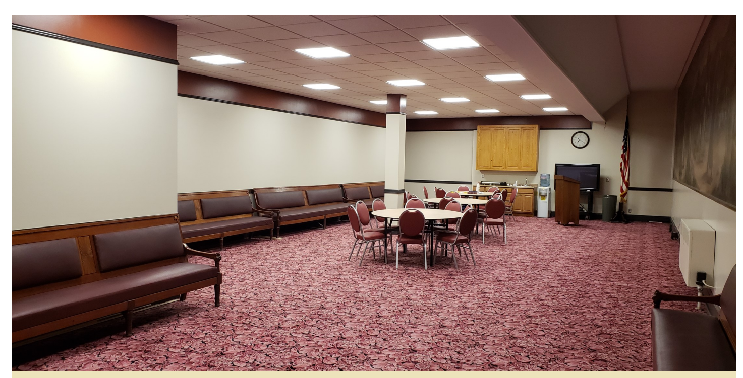
The classroom was modified to include a second conference room and a storage closet.

Donald J. Nolley, 33° I∴G∴H∴ Venerable Master Lodge of Perfection