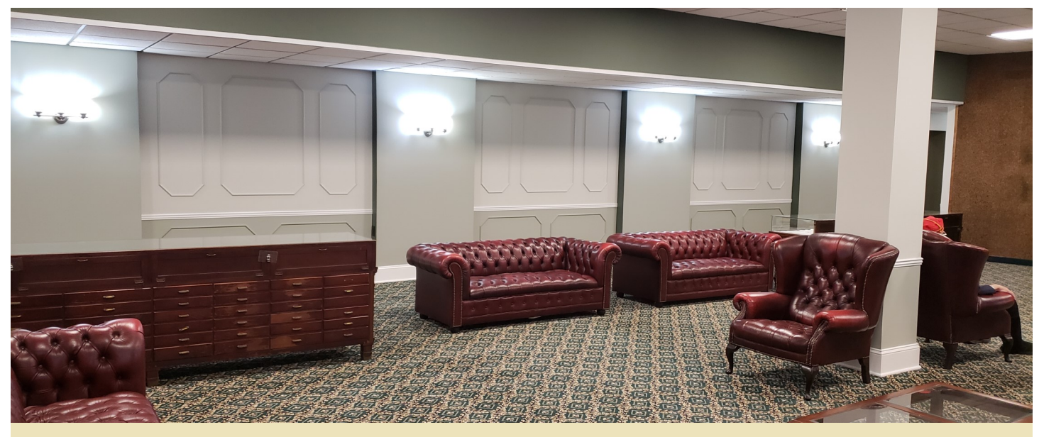
A cleaner, updated look was given to the upper lounge.